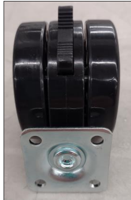
Figure 2 Castor