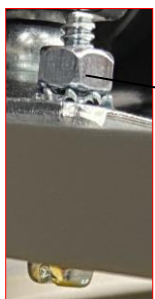
Figure 4 Long Screw Installation, for Phothera 600-3D, with doors, with close up.