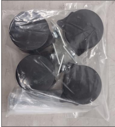
Figure 1 Castor Kit

The castor kit comes with four (4) castors and two (2) sets of sixteen (16) screws with lock washers and hex nuts. Note: The longer set of screws are intended for Phothera 600-3D units with doors.